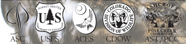
ACES' Tours are a partnership of the above organizations in support of environmental stewardship.